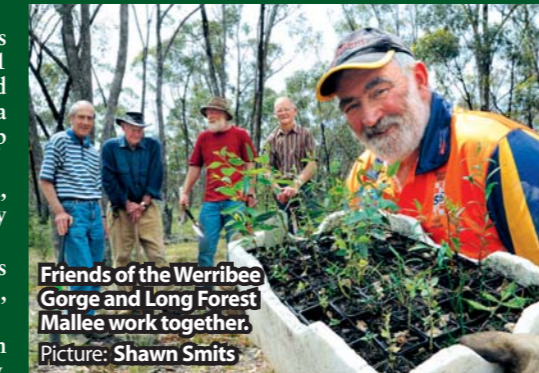
Friends of the Werribee Gorge and Long Forest Mallee work together.